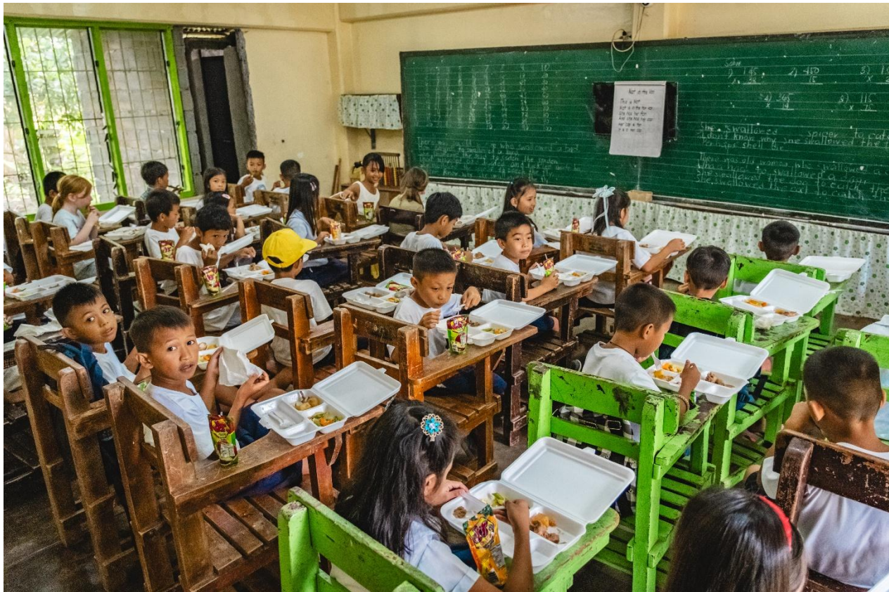
Read and Feed Program