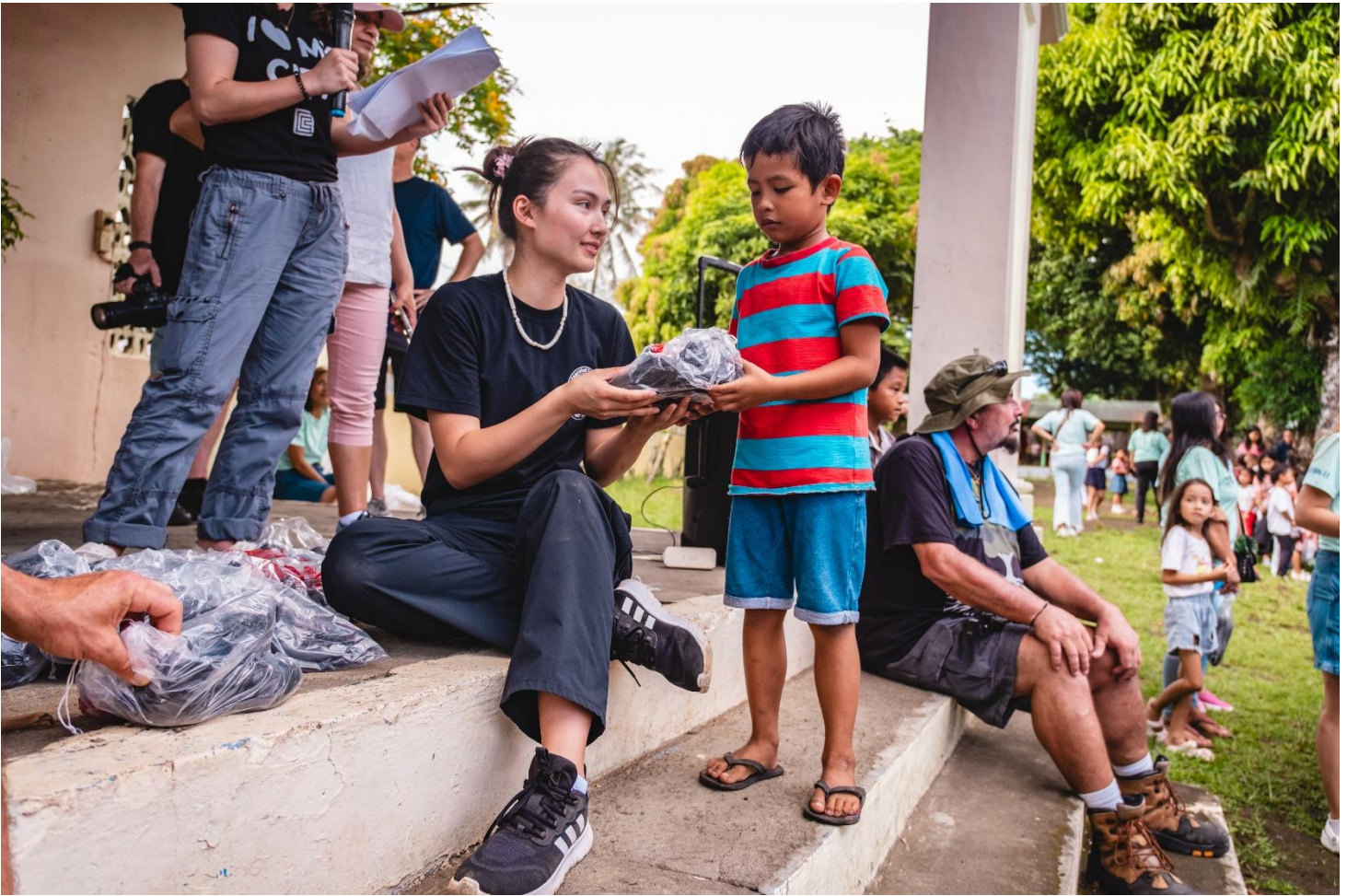
Annual Schools Shoes Project