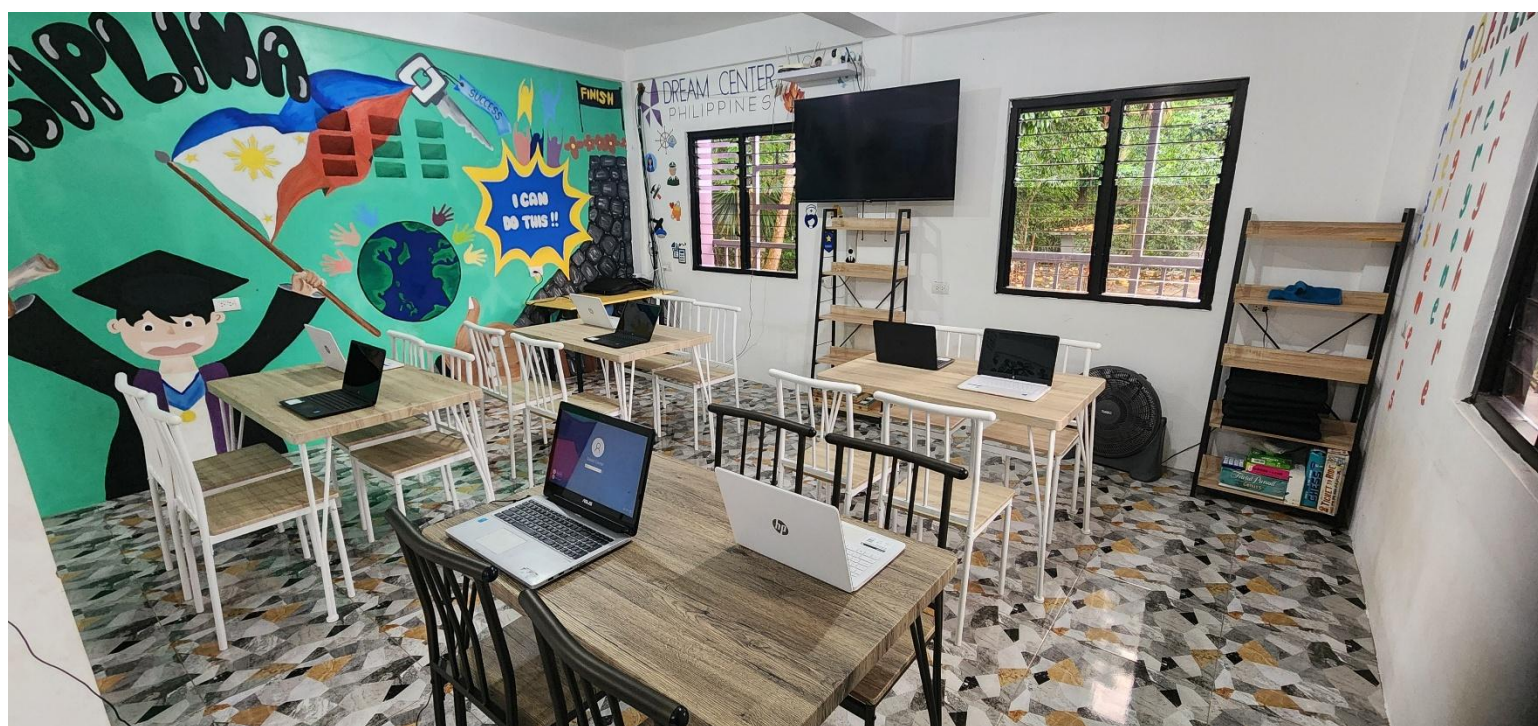
Student Center After