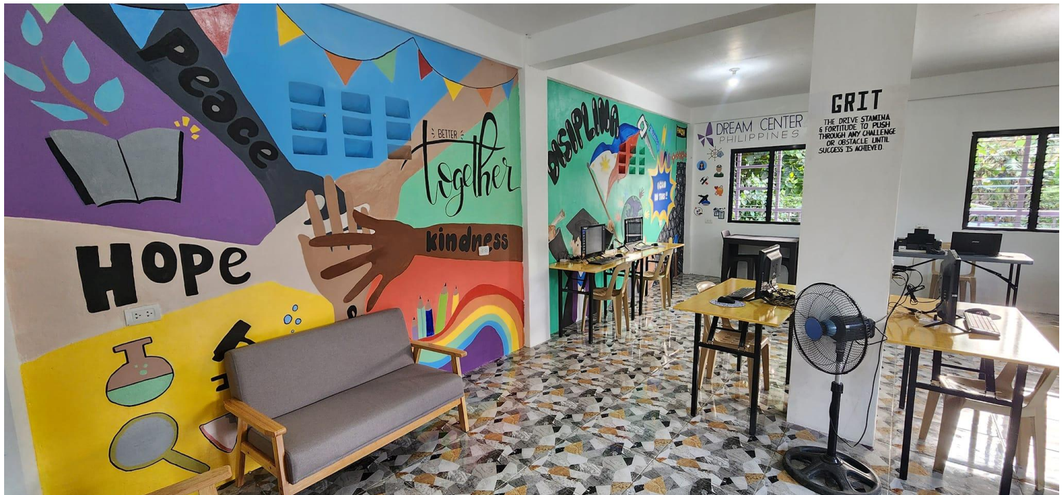
Student Center Before

The computers, printers, and access to the internet are life changing... I feel like I have a family here.”